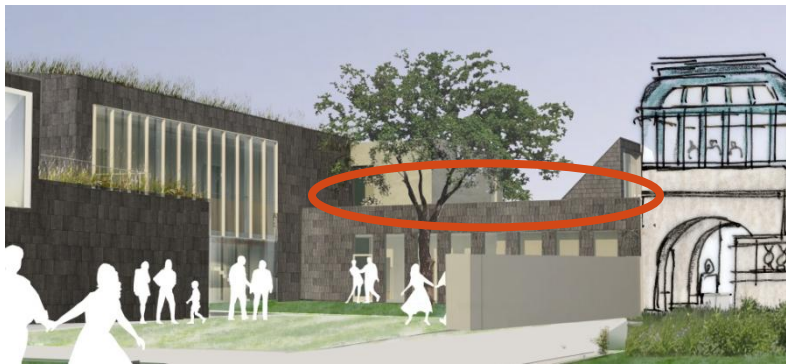
Figure 1: Walkway between Addition and Mansion 1

The mansion and addition are connected by a 10'4" wide hallway that runs 45' from the studio classroom and hallway in the addition to the corridor in the mansion; this hallway can be seen highlighted in orange in Figure 1 below. Since the space in this hallway is unoccupied unless visitors are going between the two buildings the space is low density. To incorporate more of the sustainable design seen in Swedish culture for the American Swedish Institute, the roof of this hallway is another prime location for an additional green roof. Currently this roof space is not used for anything, with the addition of an intensive or extensive green roof; this space has the possibility to become accessible to the public. Access for this green roof would be from the second floor of the addition in the hallway on the western side and the second floor of the mansion from the hallway in the western side.